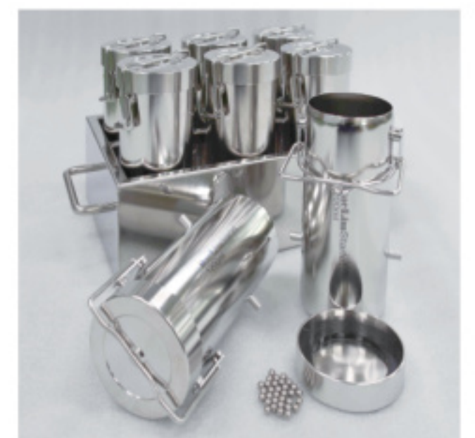
Test pot (1200ml)