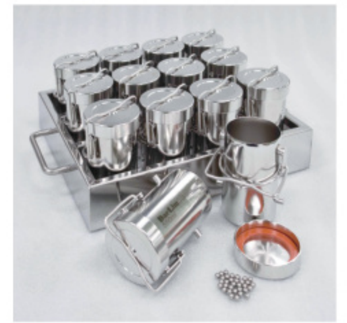
Test pot (550ml)