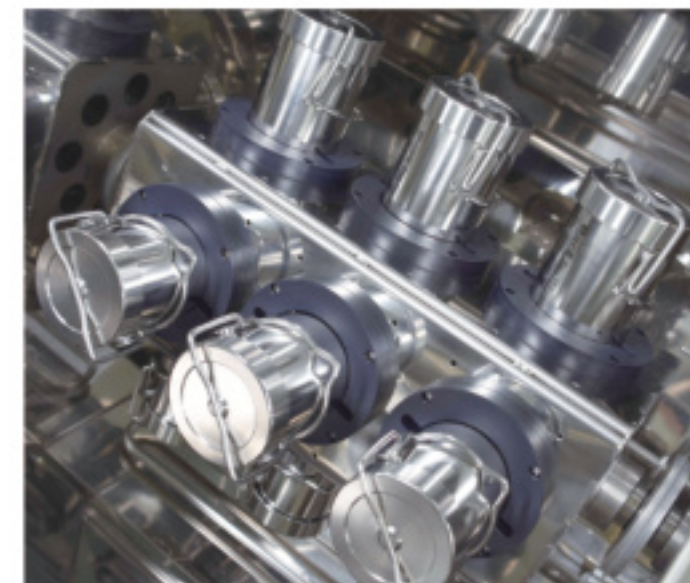
Pot holder (Only 550ml)