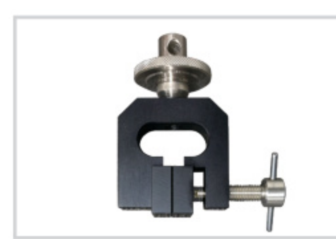
Manual chuck (Option)