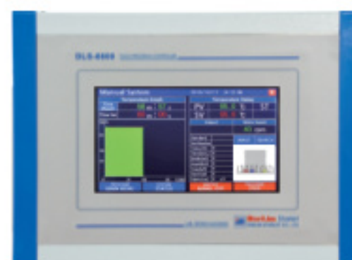
Control panel (2 Bath)