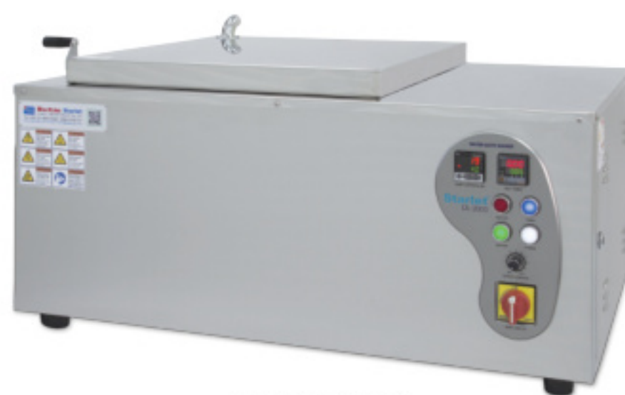
DL-2003 (1 Bath)