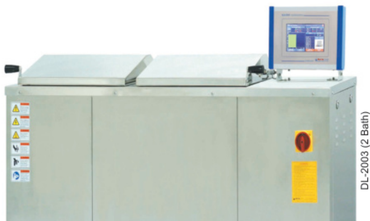
DL-2003 (2 Bath)