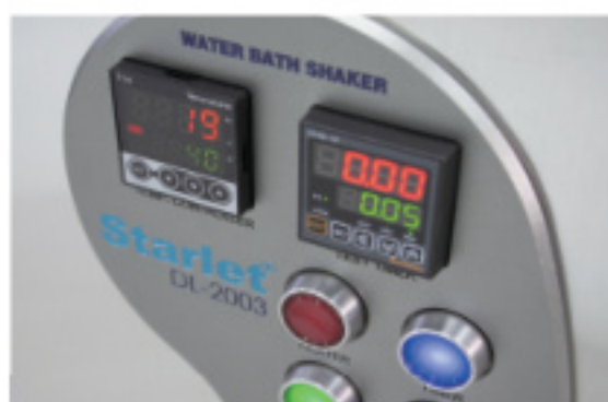
Controller (1 Bath)