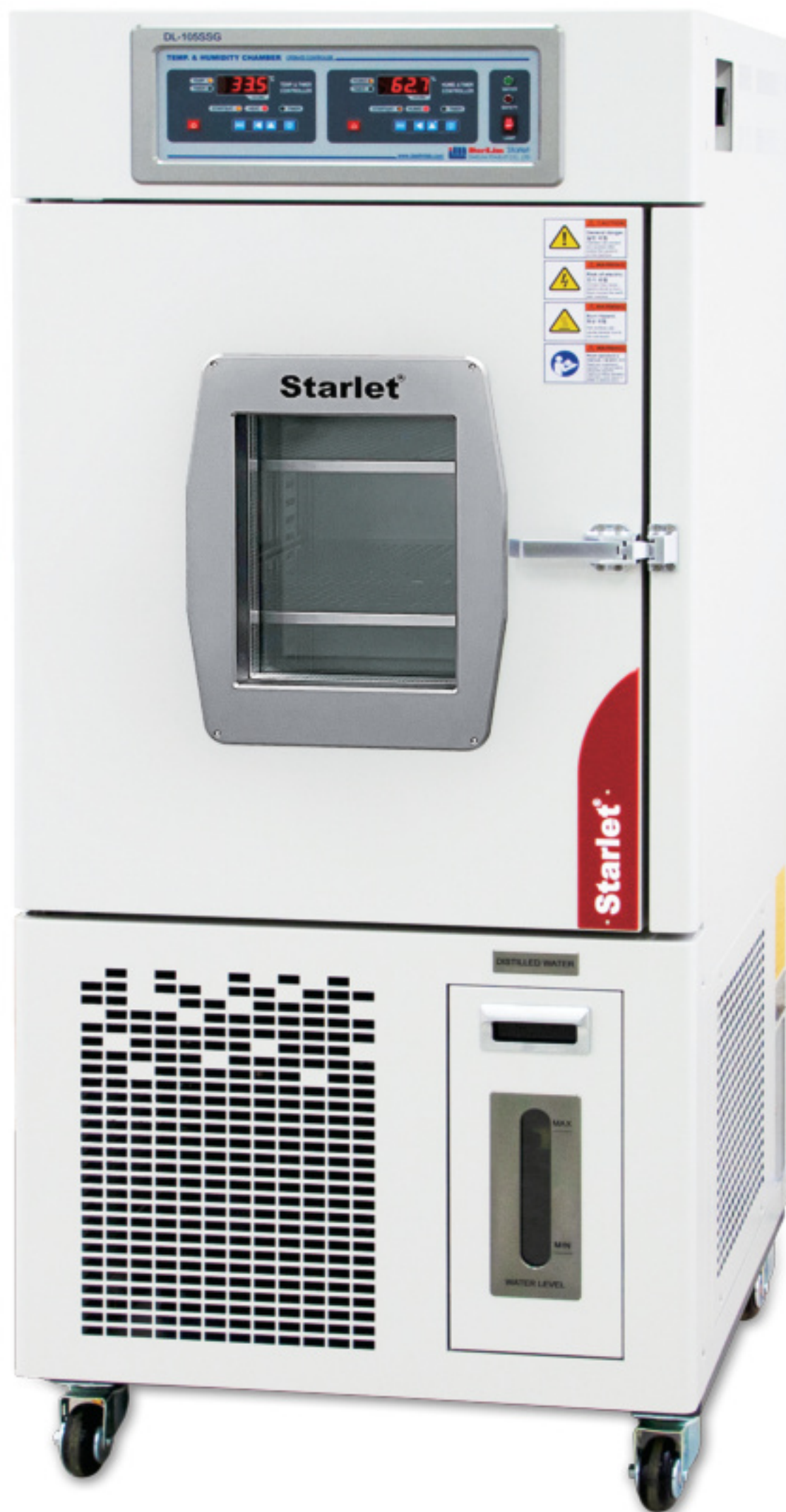
DL-105SSG (Viewing glass window)